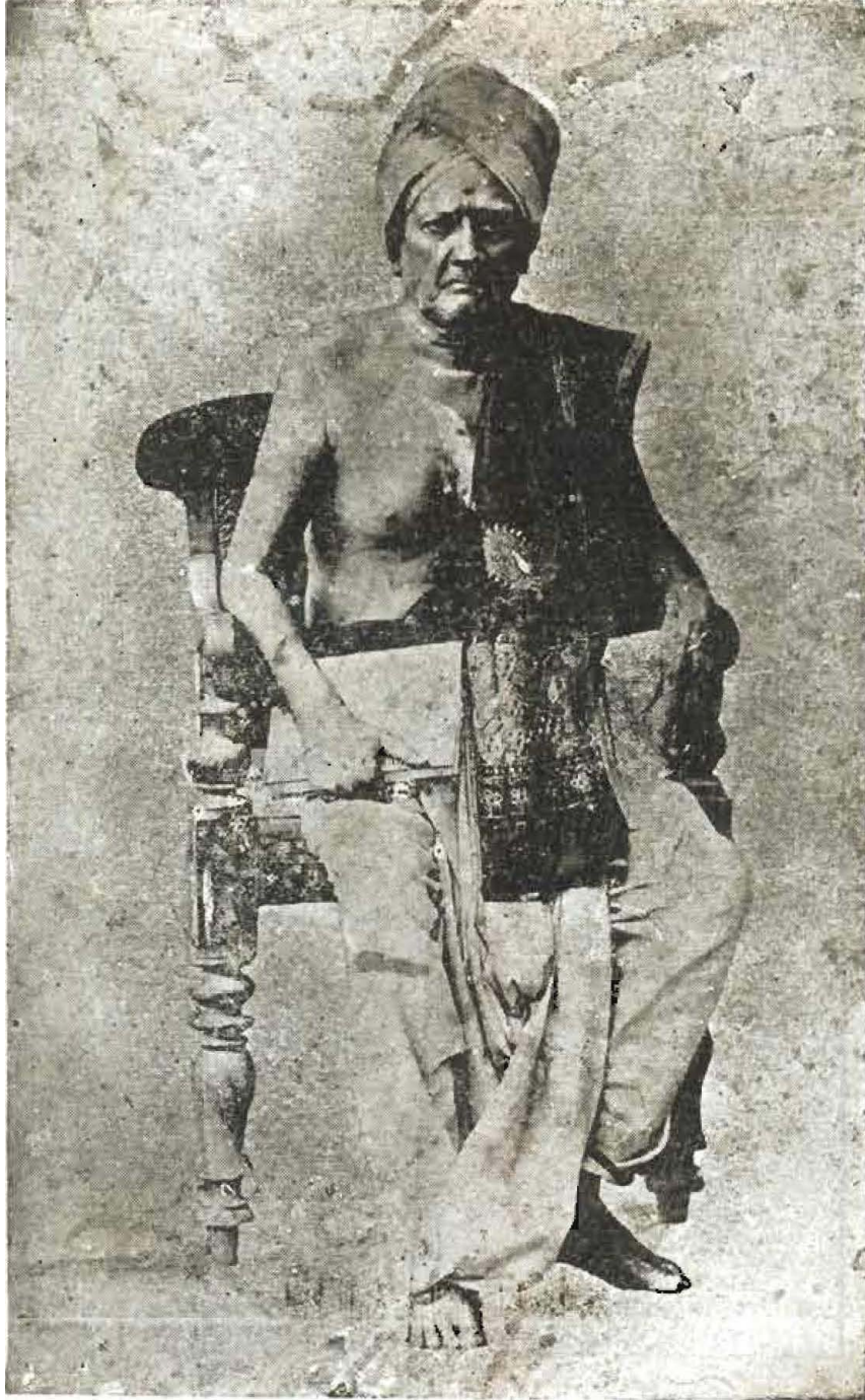
Subbarāma Dīkṣita (1839 A.D — 1906 A.D)